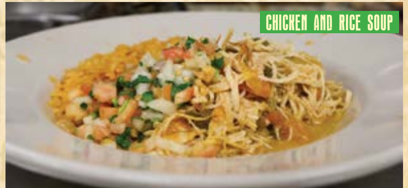
CHICKEN AND RICE SOUP

Chicken, rice, pico de gallo, tortilla chips - 11.99