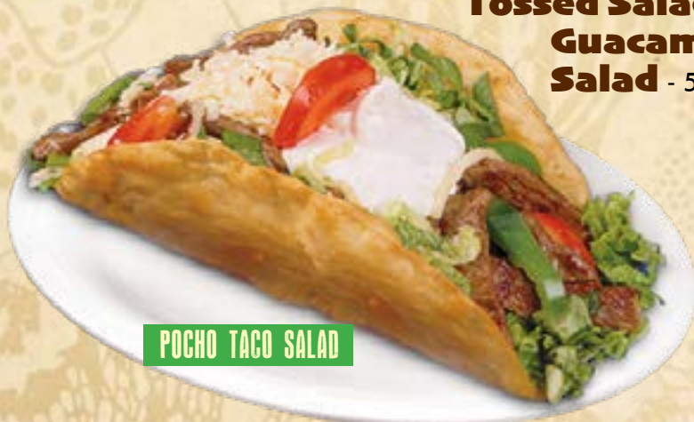
POCHO TACO SALAD